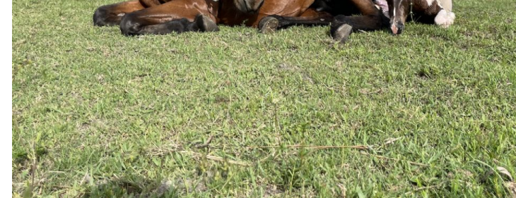
Twiggly laying down with her foal Lavender.