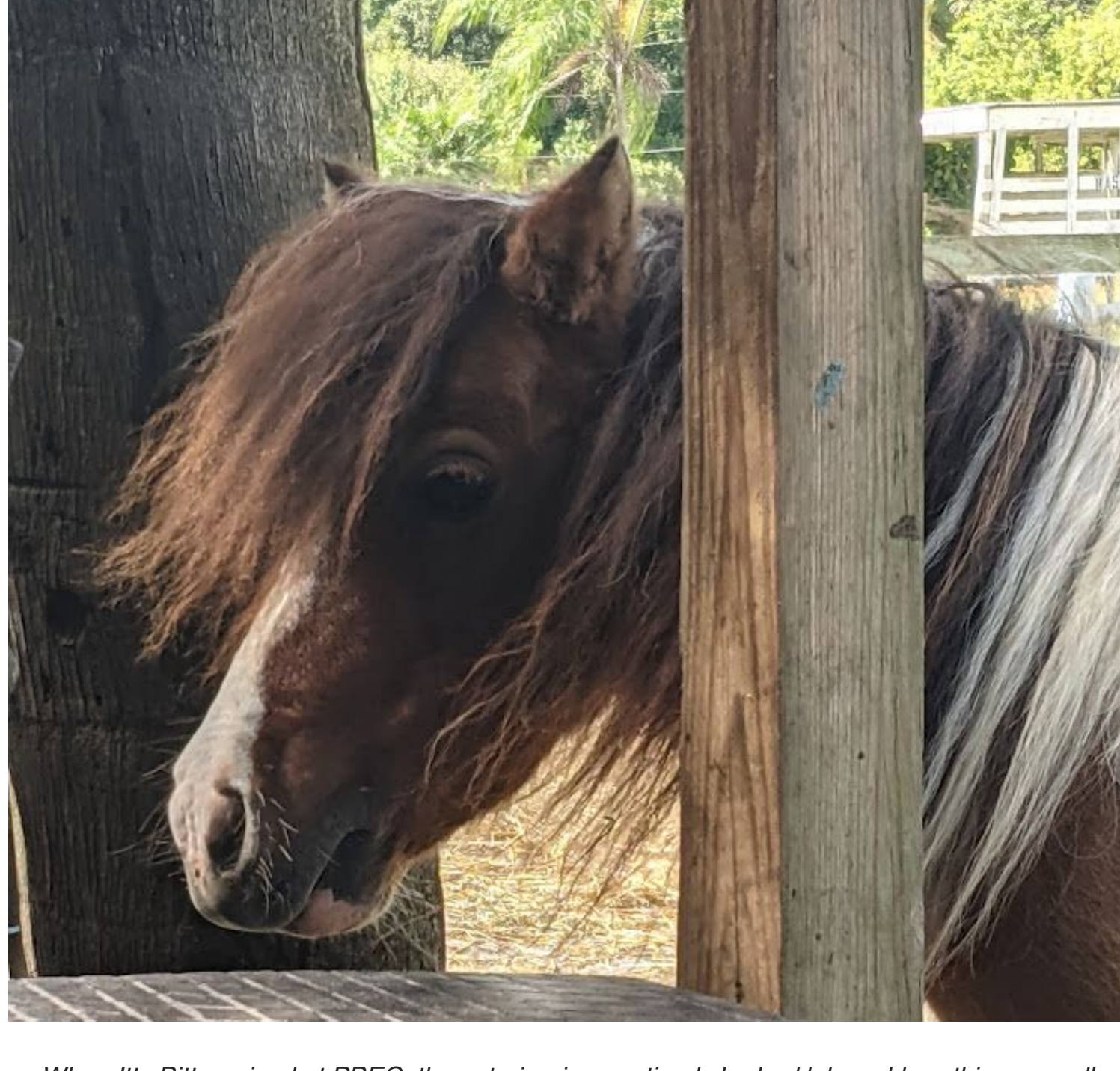
When Itty Bitty arrived at PBEC, the veterinarians noticed she had labored breathing as well as gas distention in the abdomen.